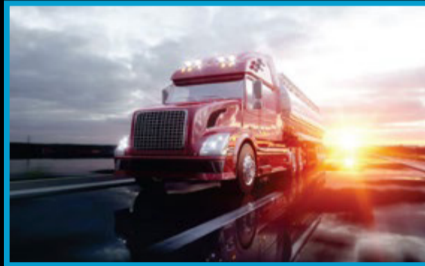
ON-HIGHWAY TRUCK FILTERS